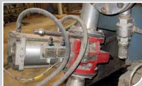
Flowrox pinch valves at GIIC

Flowrox pinch valves were chosen in 2008 when Gulf Industrial Investment Company (GIIC) was commissioning their second iron ore pelletising plant in the Kingdom of Bahrain. Flowrox pneumatically actuated PVE 100 – 150 mm valves are operating in pellet coating and iron ore slurry lines as well as in various side applications. The GIIC plant provides the highest quality pellets to markets all over the world. The best flow control solution was built in cooperation