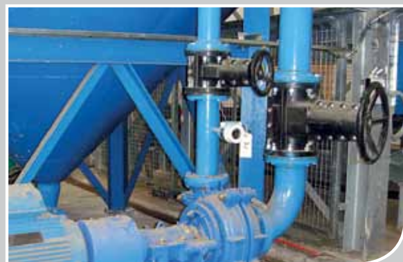
Flowrox PVEG valves at Sims Metal Recycling

Early 2011, Flowrox PVEG valves were chosen by Sims Metal Recycling at one of their recycling plants in the UK. The light-weight manual operated PVEG valves are used to isolate pumps and tanks in their DMS plant. Flowrox products form a key part of Sims' continued investments in the latest products and separation technologies, allowing them to recover maximum metal at minimum cost.